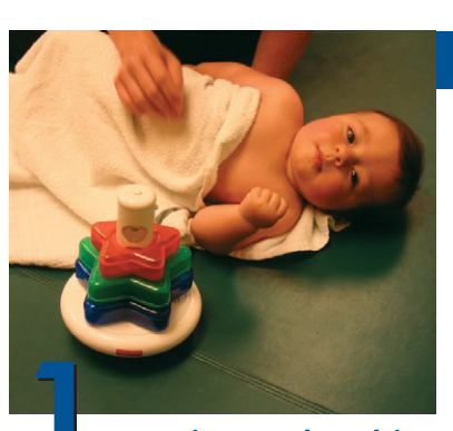
Dressing and Bathing