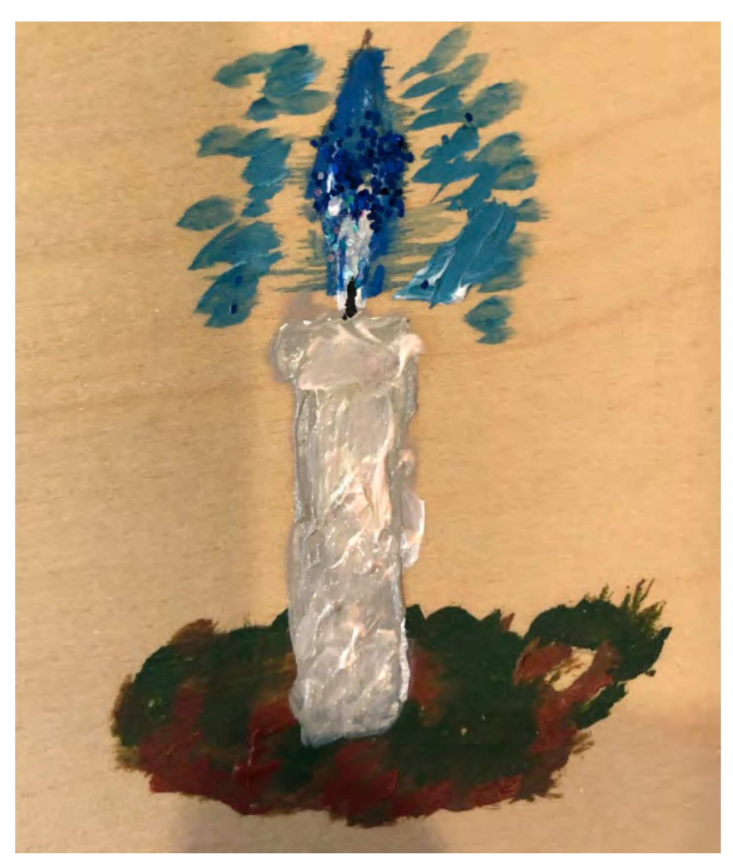
Blue Candle MAX CORYELL